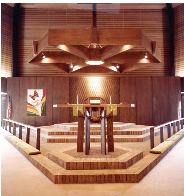
ABOVE: The chancel area in the 1969 Sanctuary (now our Activity Center).