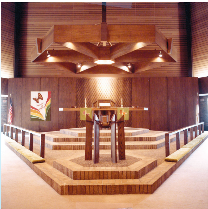
Chancel area of the 1969 sanctuary

We're celebrating 75 years as a congregation, and are proud of our place in the history of Roseville. You are invited to any of the special events planned in celebration. All are welcome at RLC! We are a community united by grace.