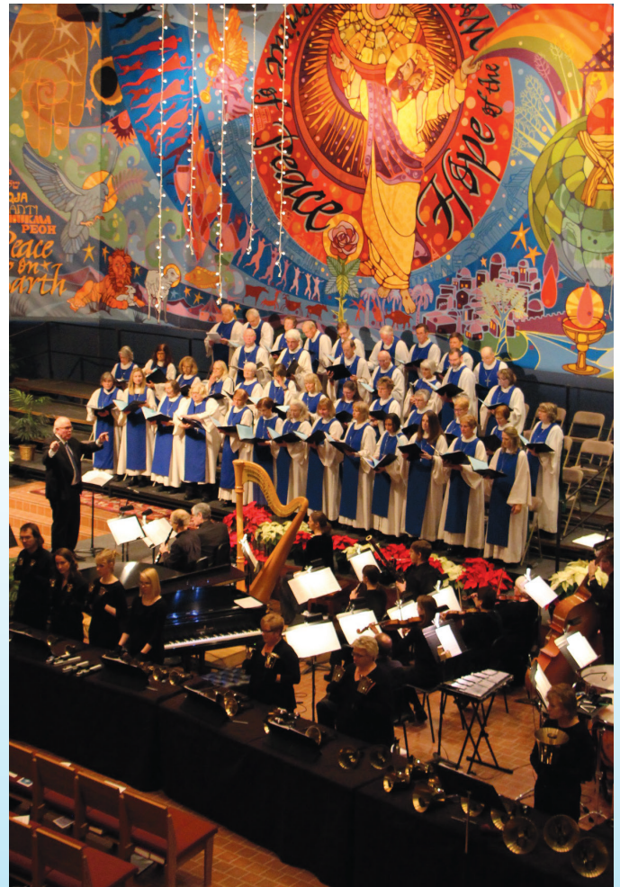
2016 Christmas Festival Concert in the worship center