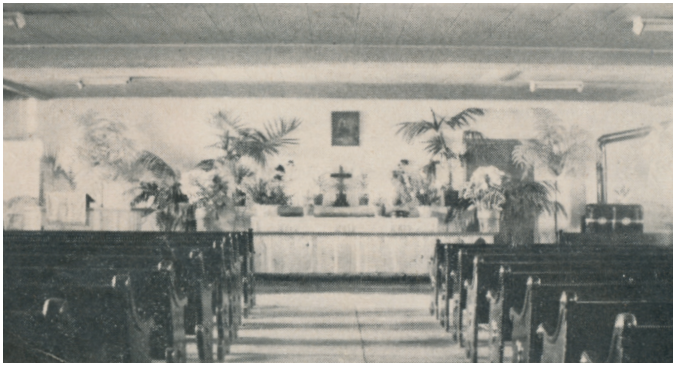
1949 Palm Sunday worship in the basement church