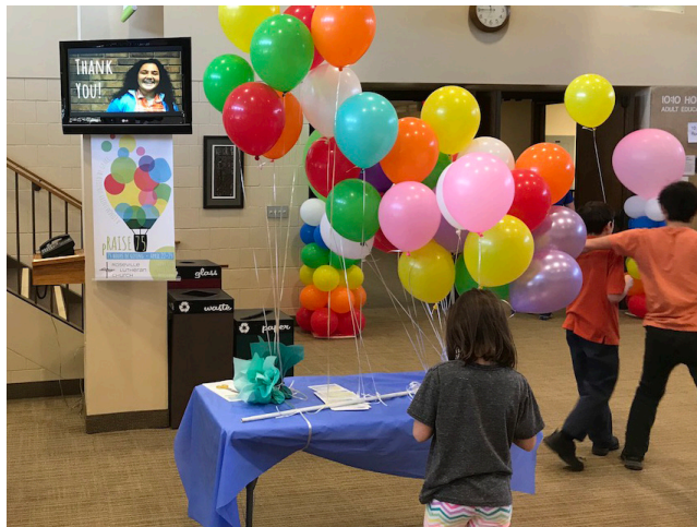
April 22 pRAISE 75 Kick-off event had balloons for all!